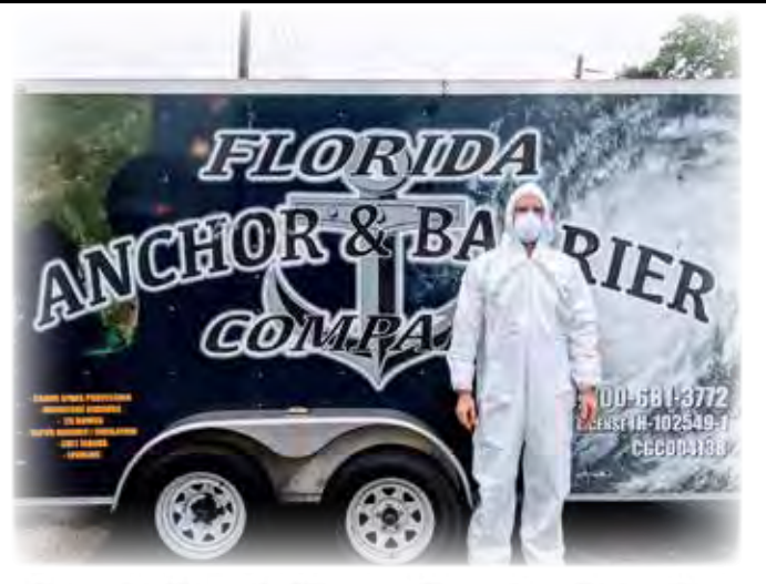
Insulation & Vapor Barrier Repairs Soft Floor Repairs & Laminate Flooring

Wishing you good health and safety, The Florida Anchor & Barrier Team