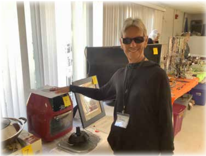
CHINESE AUCTION BARGAINS

THE PANCAKE BREAKFAST WAS A GREAT SUCCESS Thank You, Shufflers