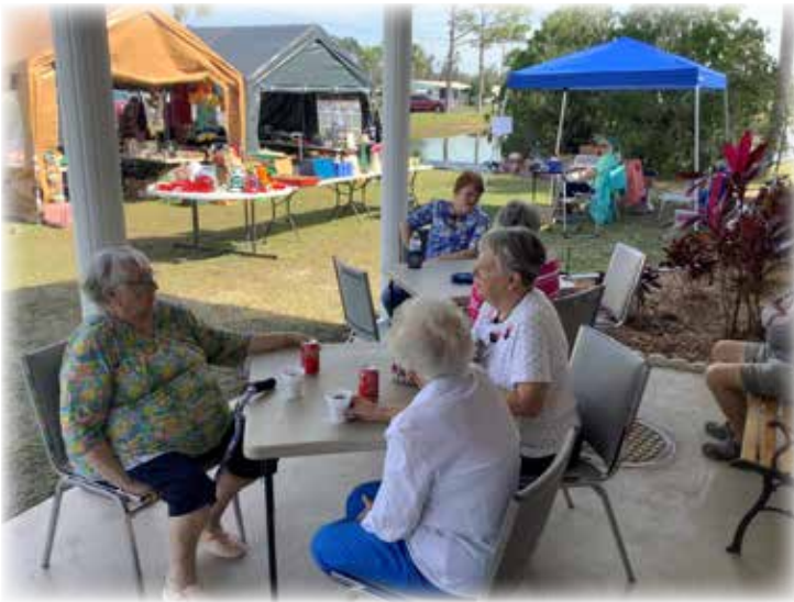
ENJOYING THE BEAUTIFUL DAY