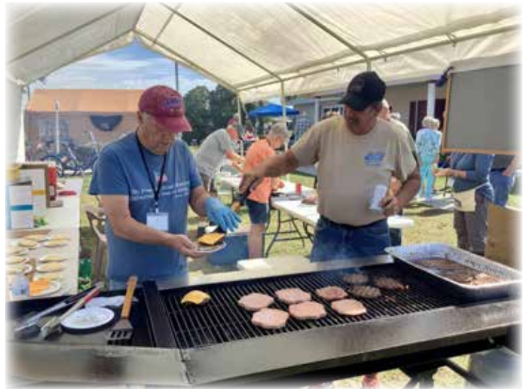
GRILLING AT THE OUTDOOR FOOD TENT