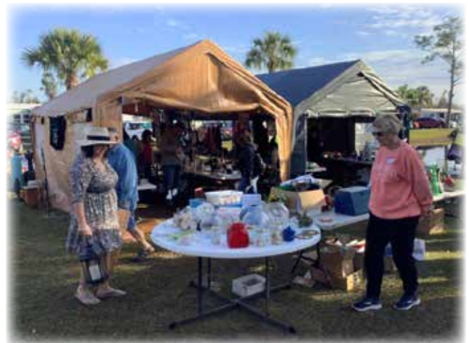
LOTS OF "YARD SALE" ITEMS