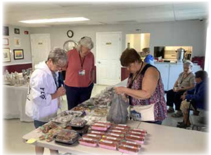
BAKE SALE GOODIES