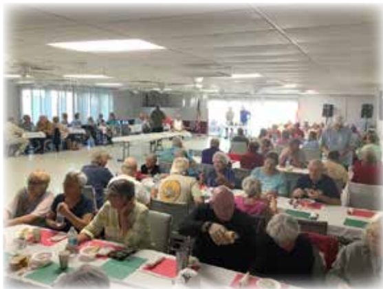
GREAT CROWD AT ITALIAN NIGHT