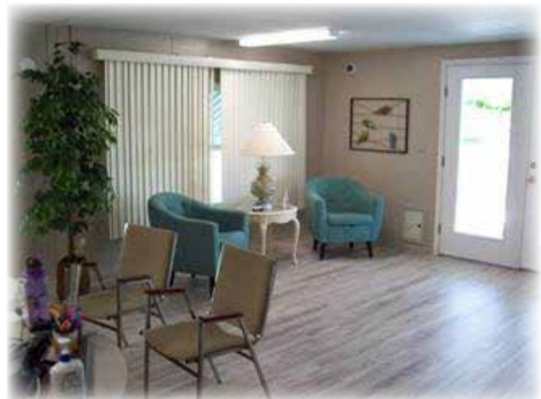
ENTRY FROM EASY STREET