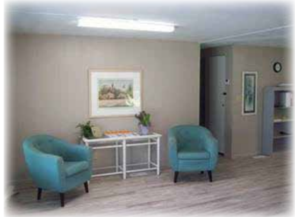
NEW WAITING AREA